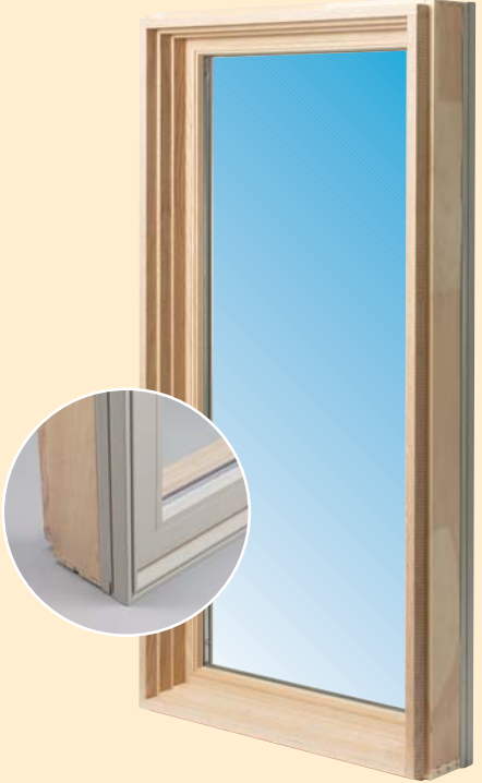
Your picture frame to the world outside

With central air conditioning in more homes than ever, Fixed Lite Windows have gained in popularity. They are highly regarded for the added comfort and security they provide. Their clean, simple lines act as a picture frame to the world outside and their maximum glass area allows for large amounts of natural light to come through and brighten any room. Our Liberty fixed lite windows are engineered with a sash to match the sitelines of our operating windows. This design detail enhances the curb appeal of your home. When combined with operating windows, these fixed lites can be used to create visually spectacular feature windows in your home.