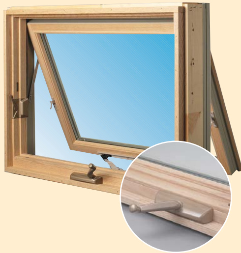
A practical solution for good ventilation

For a room with limited wall space and a need for good ventilation and natural light, the answer lies in Caribbean awning windows. They offer all the advantages of casement windows plus one extra feature - they are hinged from the top and can be left open slightly during a rainfall with little risk of any rain getting inside. They are an effective solution for tight areas such as bathrooms or basements. Due to their unique modular design, our Caribbean awning windows can be combined with matching fixed lites to enhance the contemporary look of your home.