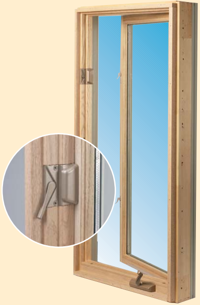
Compliment the style of your home

Tudor Casement Windows are extremely popular because of their versatility. Their long, slim styling makes them ideal when used individually in areas where wall space is limited. Designed with multipoint hardware, strong locks and a double full perimeter seal, you can rest assured our Tudor casements are secure and energy efficient. They can be opened a full 90 degrees to provide plenty of ventilation and easy cleaning. They work well in combination with fixed lite windows to make up bay, bow and picture windows. Our popular Tudor casement windows complement virtually any architectural style.