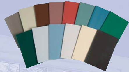
Also available in many custom colors

Colors shown are representative only, for an exact color sample ask your Pollard representative.