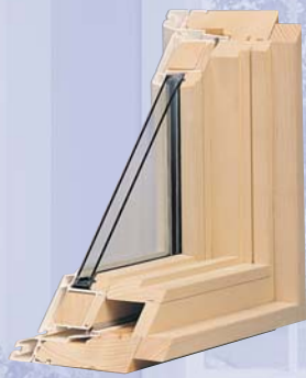
Paint Grade Pine